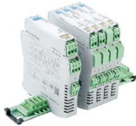
Dimensions:118.9mm × 106.0mm × 12.5mm